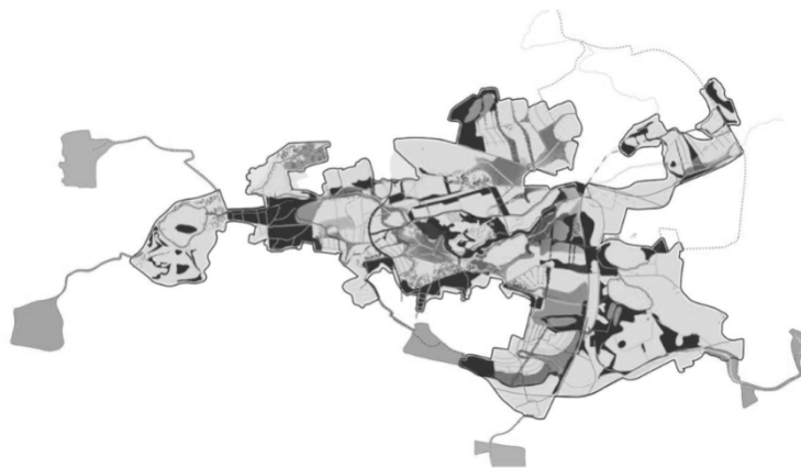
Fig.1 Seven well-established ecological compensation areas for wetland protection

In recent years, with the continuous development of our country's social economy and the continuous implementation of the western development policy, we have objectively promoted the development of the ecological wetland industry in the ethnic regions of western Sichuan, and has